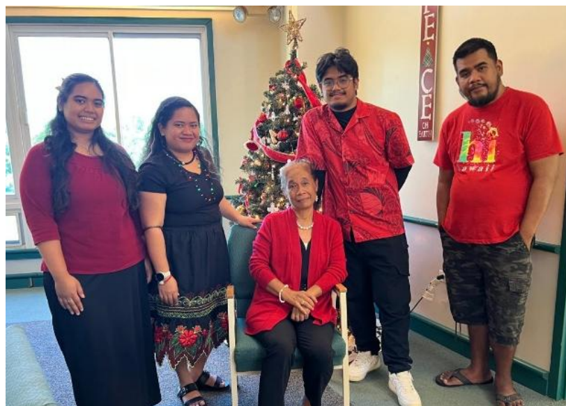
Alokoa Family-December 2025